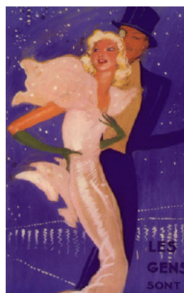
Table for Two

Bibb Lettuce With Crumbled Blue Cheese Caramelized Pecans Honey Balsamic Vinaigrette Crusty French Rolls ~ Butter Rosettes